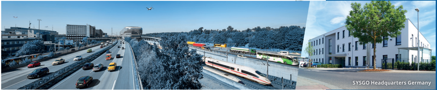
SYSGO Headquarters Germany